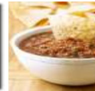
Mayan inspired salsa – Food technology.